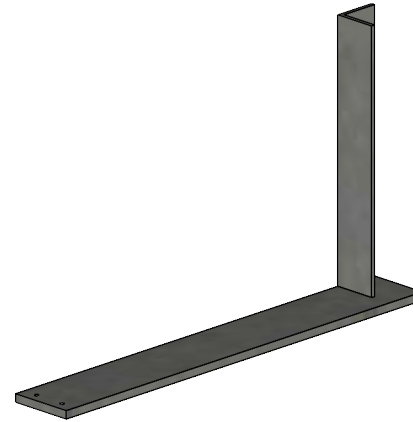
Right hand Bracket shown