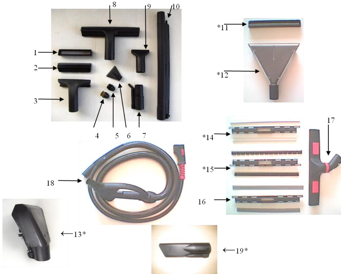
Figure 3- Standard accessories included with this model