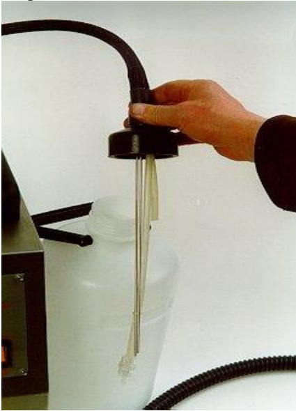
Figure 6- How to remove tank cap with sensors

Note: To perform this operation, avoid removing the cap by the flexible tube (refer to fig. 6). Do not place the cap with the probes on metallic surfaces to avoid the electronic cards misreading the presence of water.