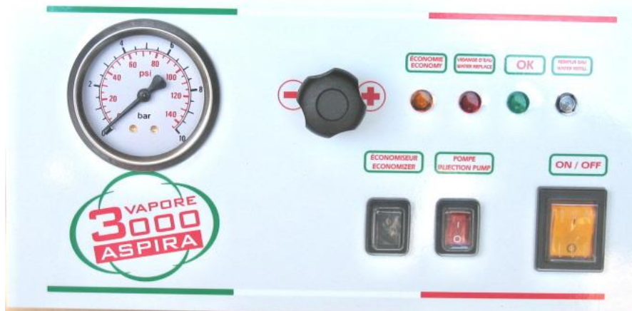
Figure 1- Control Panel