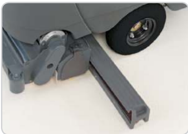
Cylindrical scrub decks sweep and scrub in a single pass with dual counter-rotating brushes.