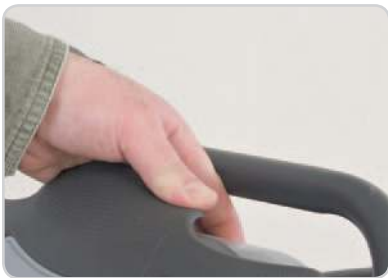
Ergonomic Soft-Touch™ paddle system provides simple, intuitive control and safe operation. Up to 20% greater productivity compared to simple switch controls.