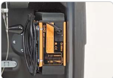
An onboard battery charger for optional wet or gel battery packages lets you recharge the machine from any outlet.