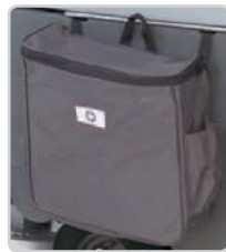
Onboard tote bag