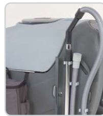
Onboard scrub-vac system