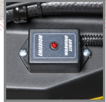
Increase safety with emission monitoring option