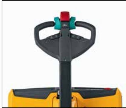
Ergonomic control handle