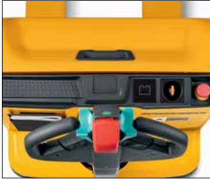
Powerful due to innovative 3-phase technology