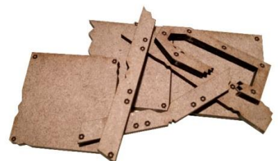
Glue part [E8] to parts [E5] and [D].

This assemblage is composed of parts [B], [C], [E 1, 2, 3, 4].