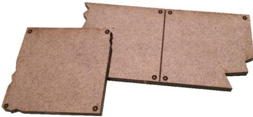
Glue part [A] at the end of part [D].

This assembly is composed of parts [A], [D], [E 5, 6, 7, 8].