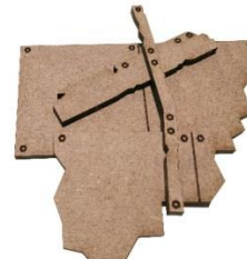
Glue part [E1] across the parts [B] and [E3].