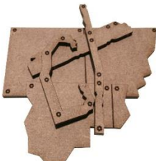
Glue next to part [E4].