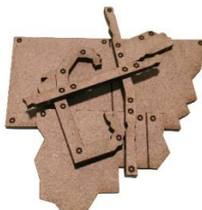
Glue over part [E2].