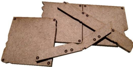
Glue part [E7] straddling parts [A] and [E5].