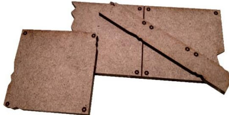
Glue part [E5] across part [D].