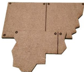
Glue part [B] on to one of the longer sides of part [C].

This assemblage is composed of parts [B], [C], [E 1, 2, 3, 4].