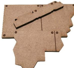
Glue part [E3] on to part [C].