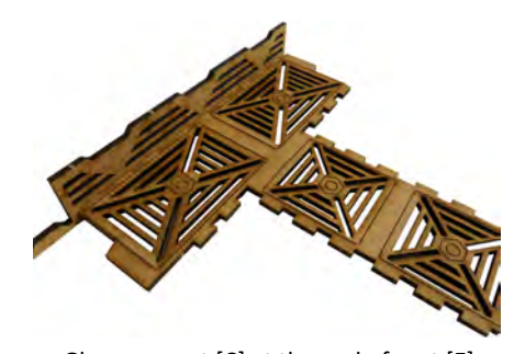
Glue one part [C] at the end of part [E]