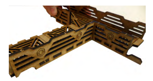
Glue part [G] perpendicularly to part [I]