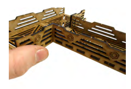
Glue part [H] perpendicularly to part [F]