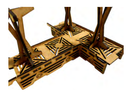
Glue three feet, one at each end of part [E] for more stability