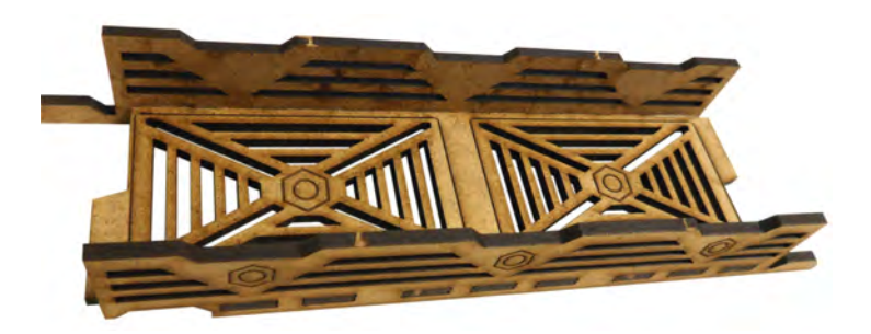
For longer sections, take part [D] and glue one part [C] on each side as shown on the picture