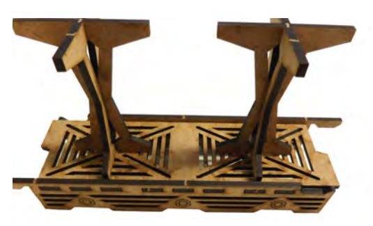
Glue two feet (assembly of [A and B]) under each long section [D]